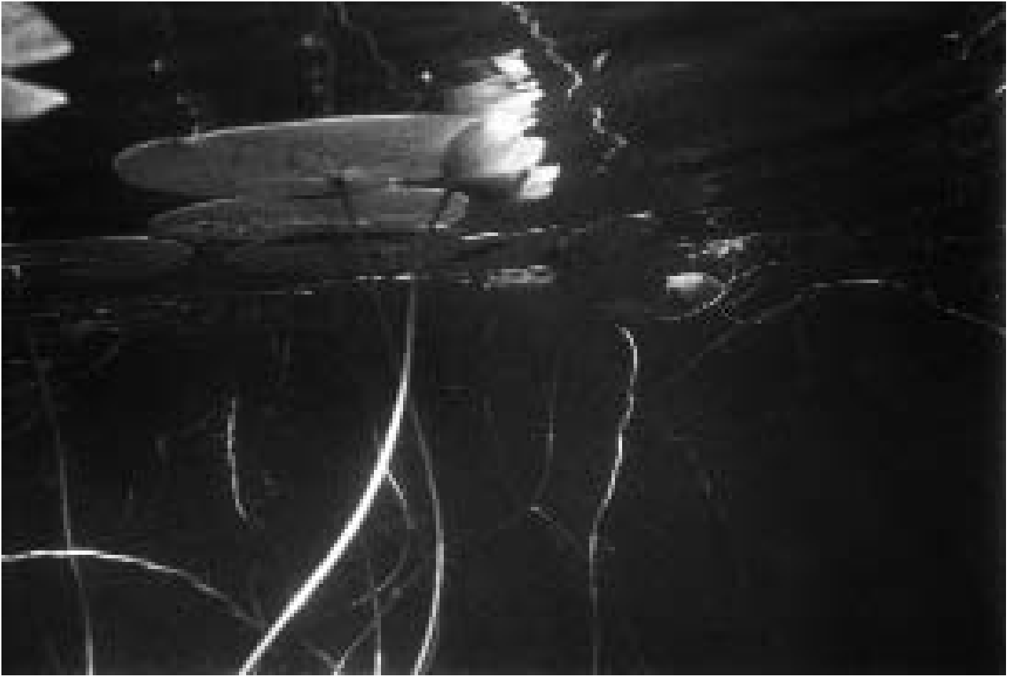
AMONG THE LILIES #4, LINCOLNVILLE, MAINE—1980