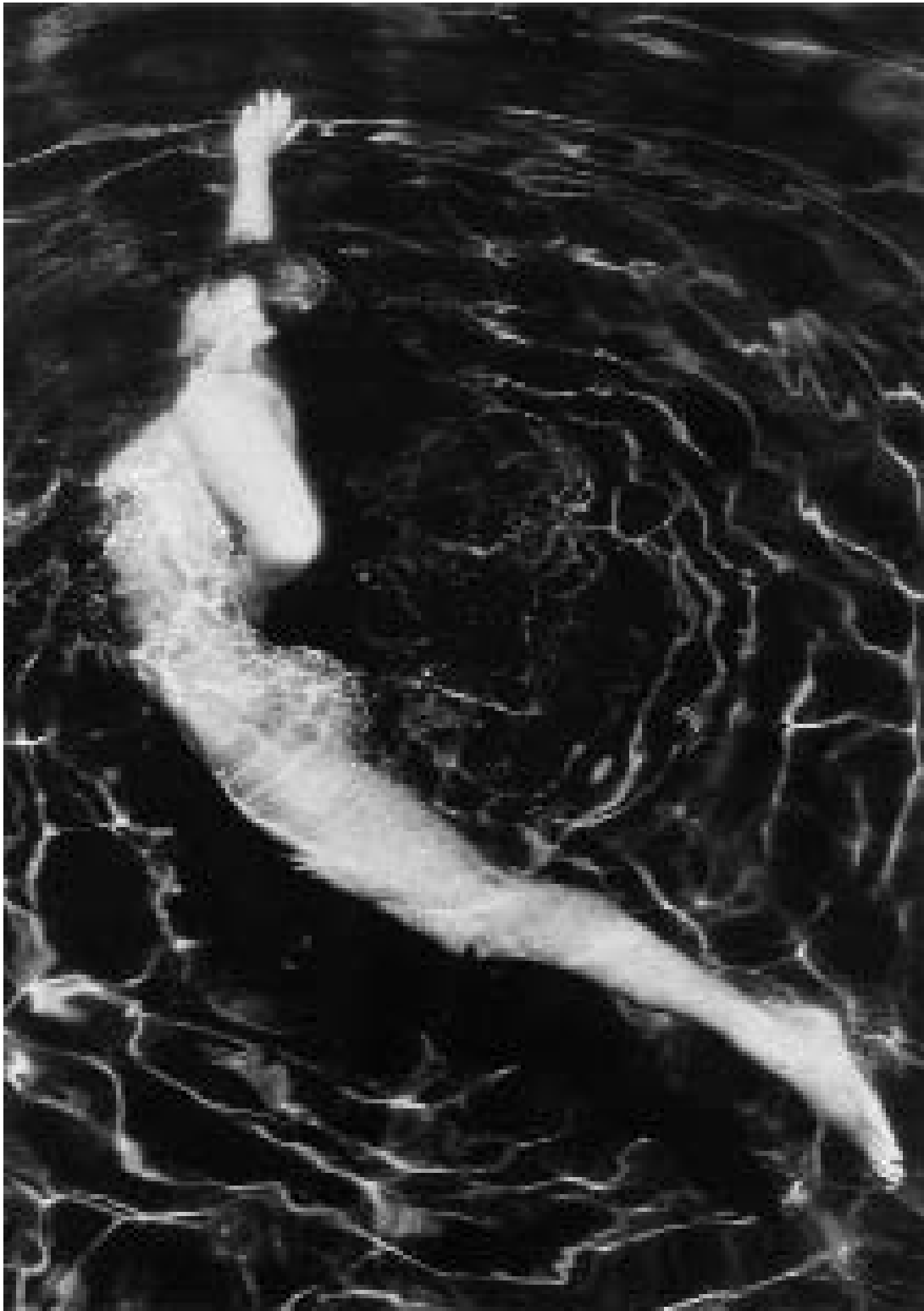
LIGHT CIRCLES, ST. HELENA, CALIFORNIA—2003