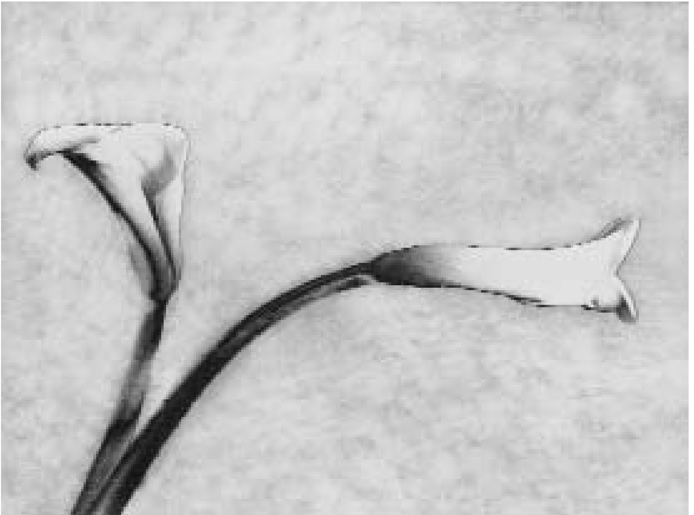
REACH TO THE LIGHT, OAKLAND, CALIFORNIA—1993