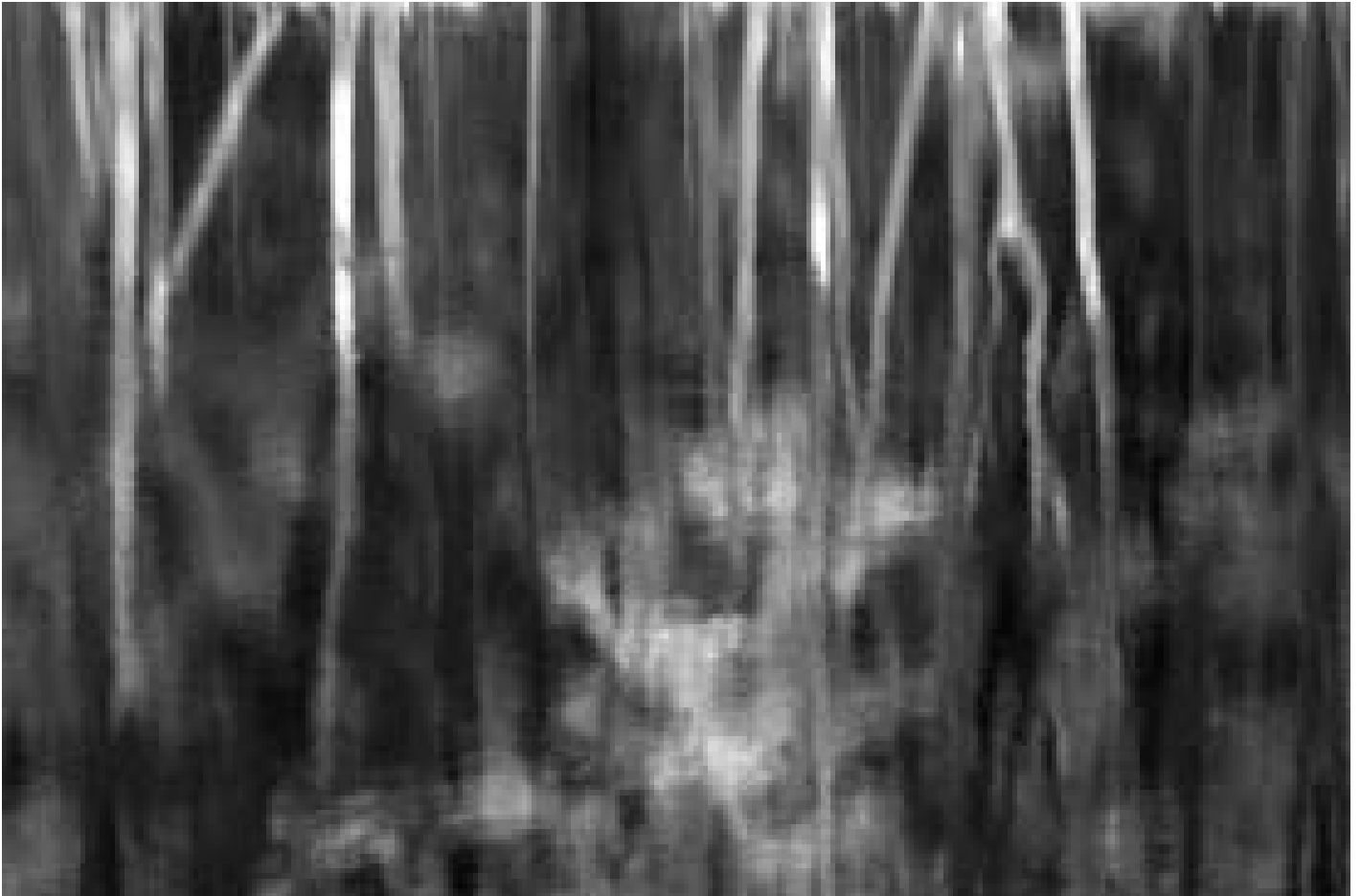
LIFE REFLECTING, GEORGETOWN, MAINE—2004