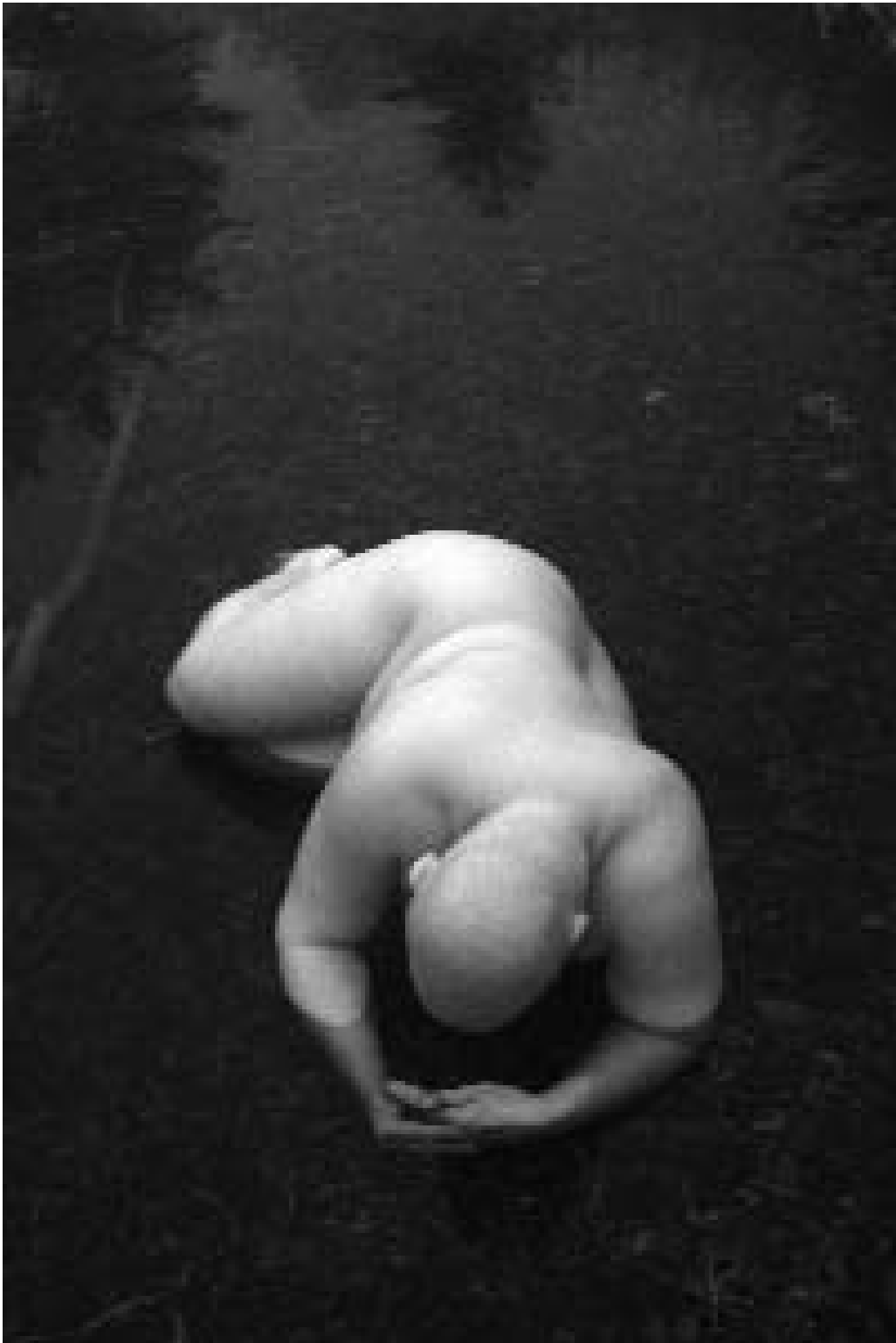
TOUCH THE EARTH, GEORGETOWN, MAINE—2004