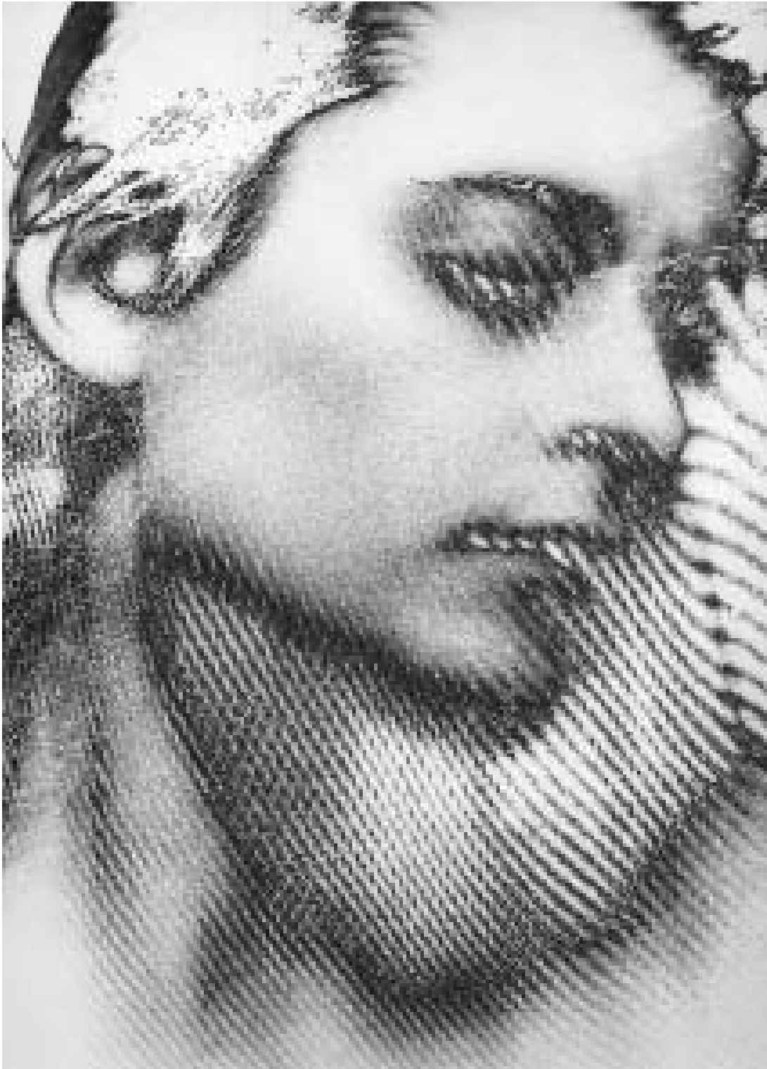
ANGEL'S DREAM, OAKLAND, CALIFORNIA—1998